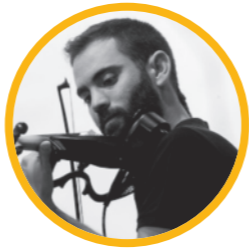
FRAN MM CABEZA DE VACA